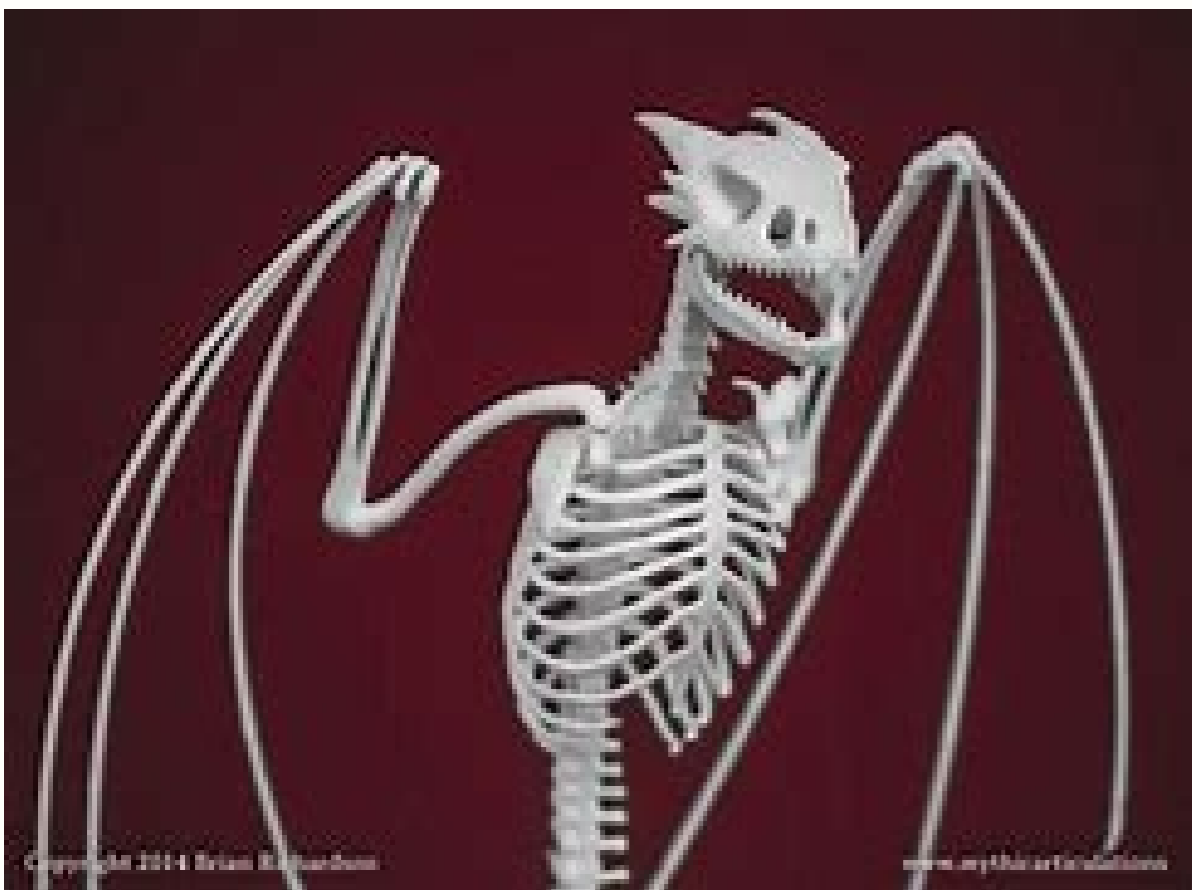
Skeletal wyvern slayer guide rs3.